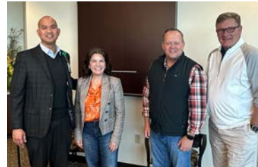
Legislators met with Lourdes Health and Trios Health CEOs to gain firsthand insight into healthcare and behavioral health challenges and solutions.

Lourdes Health, in partnership with Trios Health, provided preventative care and education to our community through a free heart health screening event in honor of Heart Health Month.