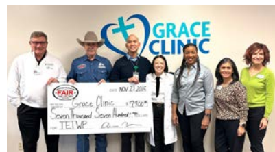
Lourdes Health and Trios Health leaders presented a check to the Grace Clinic with proceeds from the Tough Enough To Wear Pink rodeo event.